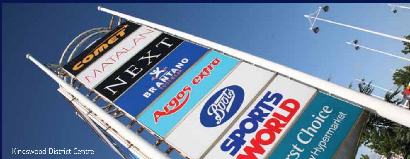
Kingswood District Centre

Area Action Plans are important documents because they set out development proposals for future housing, shops, businesses, services and facilities and transport links. They form a key part of the Council's approach to planning and, once adopted, they are used to guide new development and to determine planning applications. It also helps plan for local employment opportunities. Meanwhile, the plan can help us look at the provision of not only shopping and jobs, but also community benefits and facilities. Voice readers will recall a feature in the last edition of the magazine about a potential £2m New Life church and community building, for example, and residents are actively encouraged to visit the Kingswood Parks website at www.kingswoodparks.co.uk to give us feedback on what new facilities they would like to see.