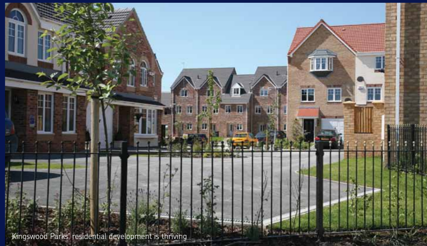
Kingswood Parks' residential development is thriving

This is your opportunity to have a look at some of the things outlined below that could be provided or improved through the Area Action Plan process.