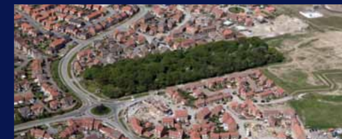
An aerial view of Kingswood Parks

As well as replying to the questionnaire, please submit any other views you have in writing via the Kingswood Parks website at www.kingswoodparks.co.uk