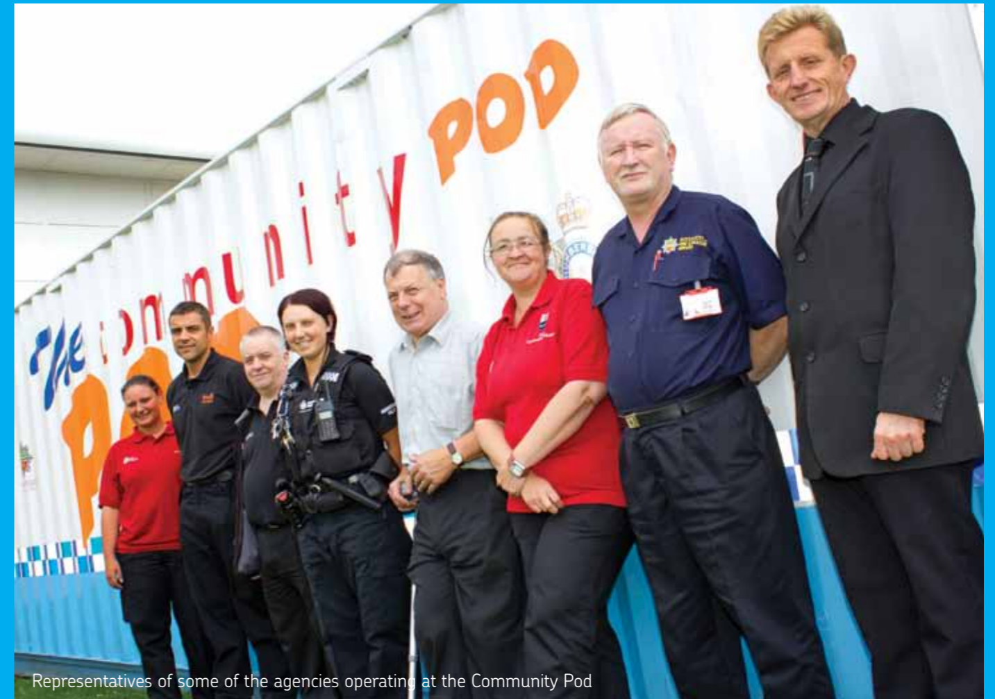
Representatives of some of the agencies operating at the Community Pod